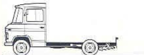
Chassis with driver's cab without rear wall