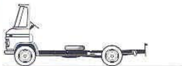
Chassis with windscreen