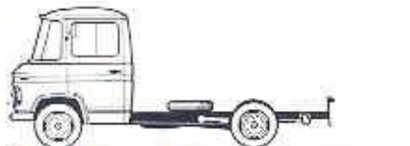
Chassis with driver's cab