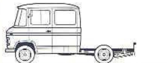
Chassis with double-size cab