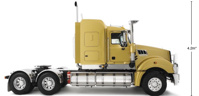
Wheel base length is optional and can be changed to suit specific applications.

Take it all and take it far with 600Hp of Cummins engine that sits behind a big chrome plated grin and chews up the biggest loads and toughest roads.