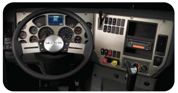
Brushed Nickel Dashboard Available in Custom and Grand Touring Trims