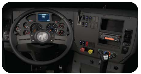
Charcoal Dashboard Available in Genuine Trim