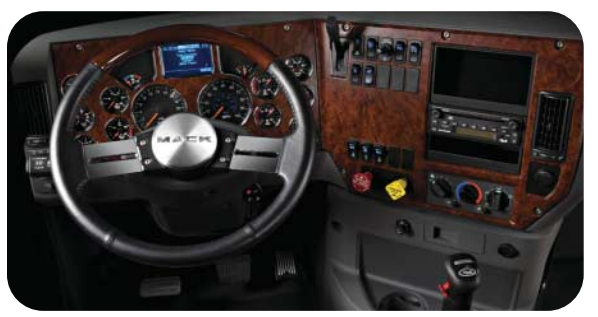
Woodgrain Dashboard Available in Custom and Grand Touring Trims