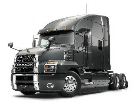
Mirror Chrome Bright