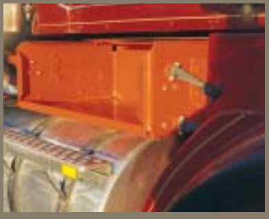
Under-cab tool box.