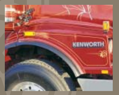
Set back front axle.

If you prefer to have tool boxes under the cab, the batteries can also be frame mounted.