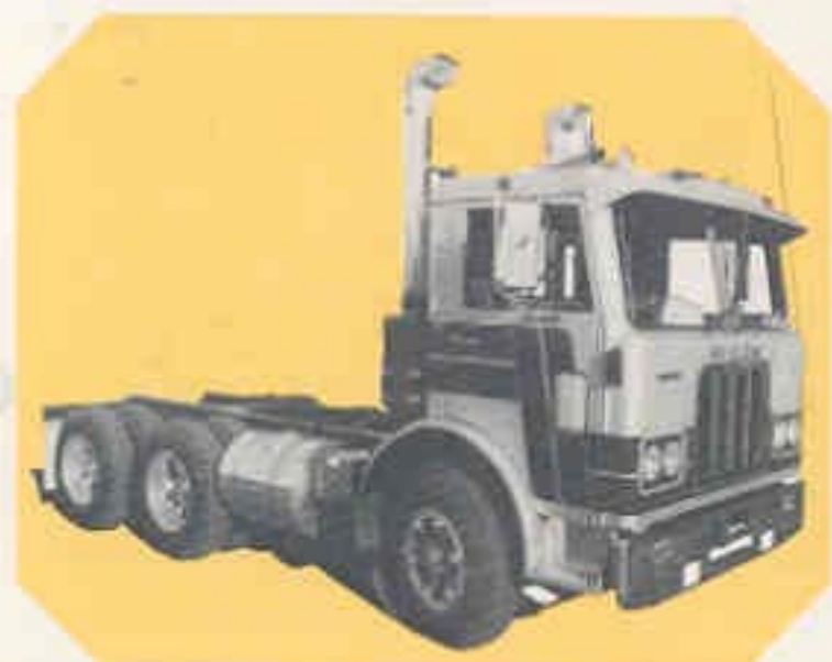
Modern styling; optimum vision thru 11 679 cm 2 laminated windscreen. Low step height, easy cab entry, exit.

LOW CAB FORWARD-COE DESIGN DESIGNED FOR SAFETY · COMFORT · DURABILITY