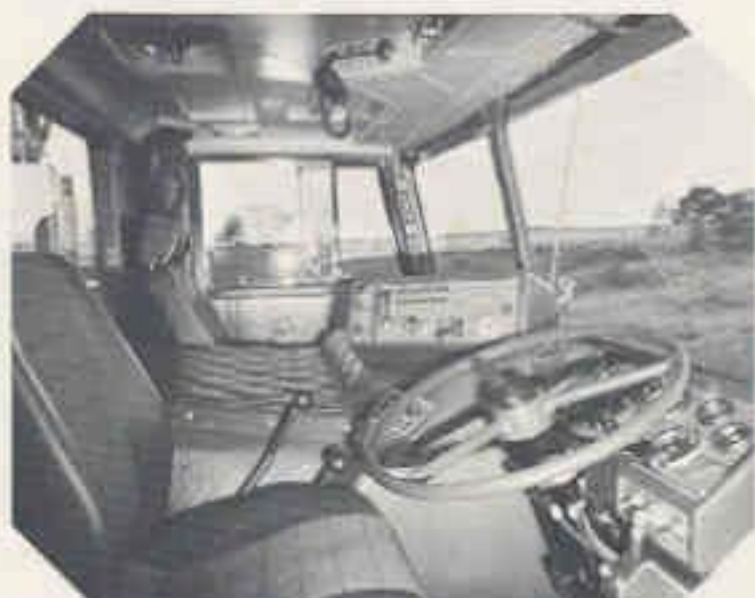
Easy scan instrument panel for quick read-out. Conveniently located controls/switches console, 1 bulb fibre optics illumination. Overhead console location of screenwiper controls, opt. broadcast or CB Radio.