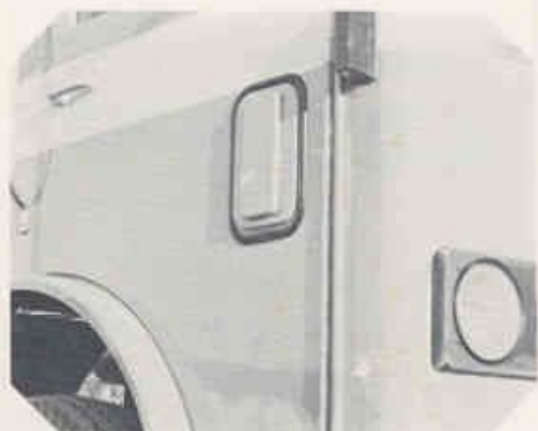
Rugged, long life "piano" hinges strengthen doors, maintain alignment.