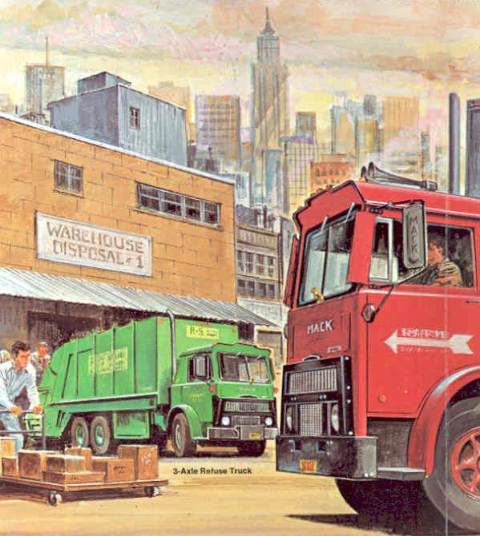
3-Axle Refuse Truck