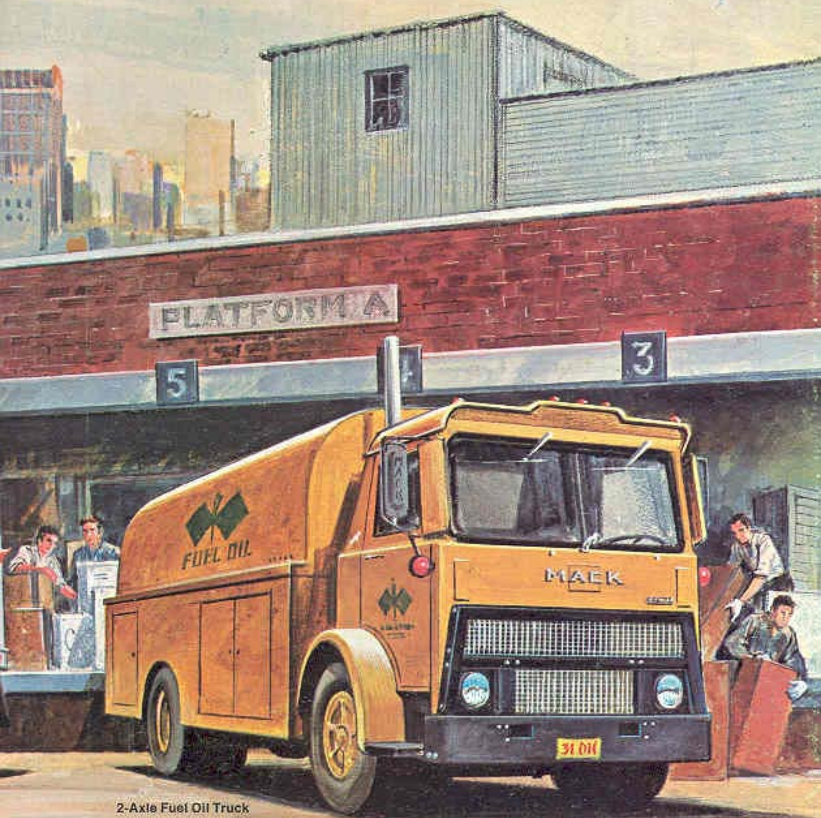
2-Axle Fuel Oil Truck