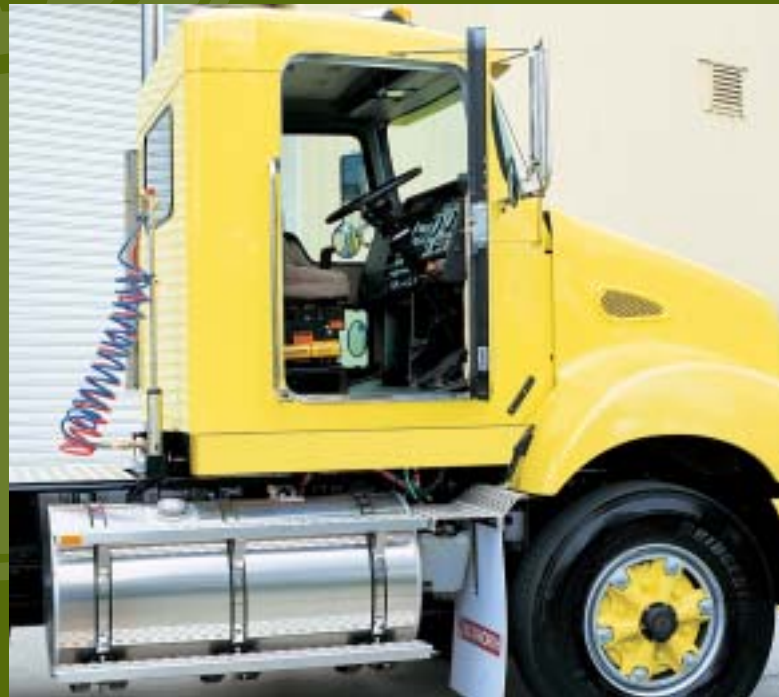
Safe and simple cab access for driver and passenger.