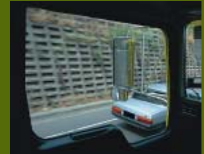
DAYLITE doors standard.