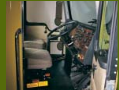
All the creature comforts, and a full range of trim colours.