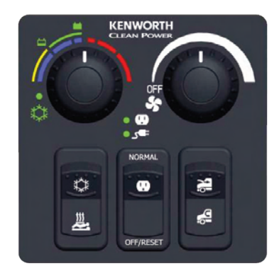
A convenient sleeper control panel adjusts cabin temperature to help keep you comfortable.

When temperatures dip, the system uses a small, highly efficient dieselfired heating unit to warm the cab and sleeper to an occupant's comfort zone.