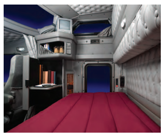
Standard features of the Kenworth Clean Power System include LED cab and sleeper interior lighting and additional insulation in the walls, ceiling and window curtains.

Kenworth Clean Power – the first true no-idle sleeper comfort system – reduces the amount of fuel used for off-duty climate control by as much as 90 percent. Just as important, the system has been optimized to perform at peak efficiency for up to 10 hours** – an entire off-duty period.