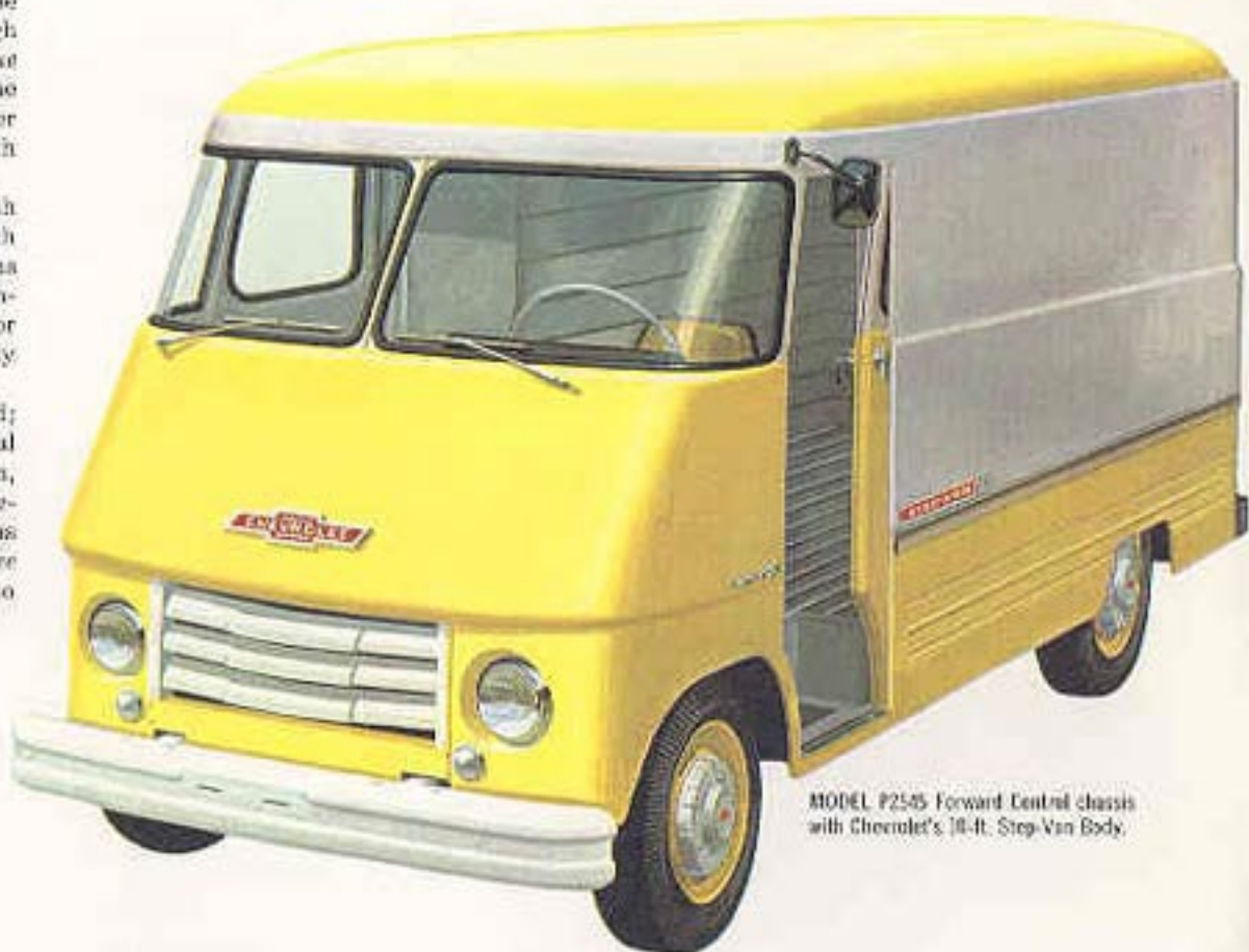
MODEL P2545 Forward Control chassis with Chevrolet's 18-ft. Step-Van Body.

Double rear doors with big 38" openings are standard; extra-wide 60-inch and 72-inch openings are optional at extra cost. You can count on hefty body protection, too, with a husky U-channel bumper that does double-duty as a handy load compartment step. With dozens of built-for-work features such as these, you can be sure a 1961 Chevrolet Step-Van is your best answer to dependable, low-cost, on-schedule route deliveries.