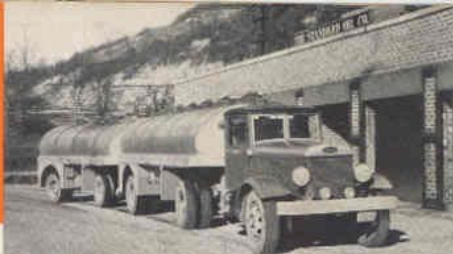
Operating out of Cleveland this Autocar-Diesel delivers bulk loads of gasoline on fast schedules for the Standard Oil of Ohio. The full trailer doubles its capacity. Notice the Autocar DeLuxe Cab.

"Follow the Leaders for they Know the Way"