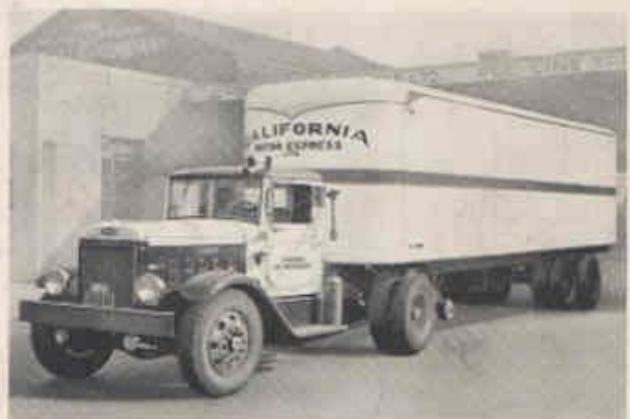
This superb tractor-trailer unit, owned by California Motor Express Ltd., San Francisco, is an NFI Autocar-Diesel of 158" wheelbase. It has a record of 100,000 miles without road failure.