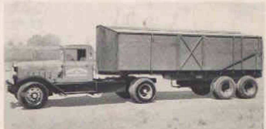
Built to comply with the laws of both California and Oregon, this Autocar-Diesel tractor's 22-foot trailer has a five-foot tail gate which can be lowered to carry additional all drums. It is owned by Contract Carriers, Inc., Fresno, Calif.