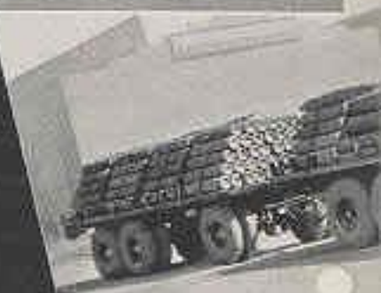
Right: Crow Transportation Co.'s Autocar-Diesel carries 55 acetylene cylinders on its own chassis, and tows 195 oxygen cylinders behind, over mountain roads of Southern California.