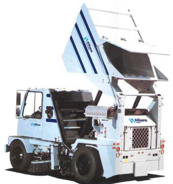
RIGHT Mid-mounted for balanced weight distribution and superior loading characteristics, the standard high dump hopper empties into a 114" container.