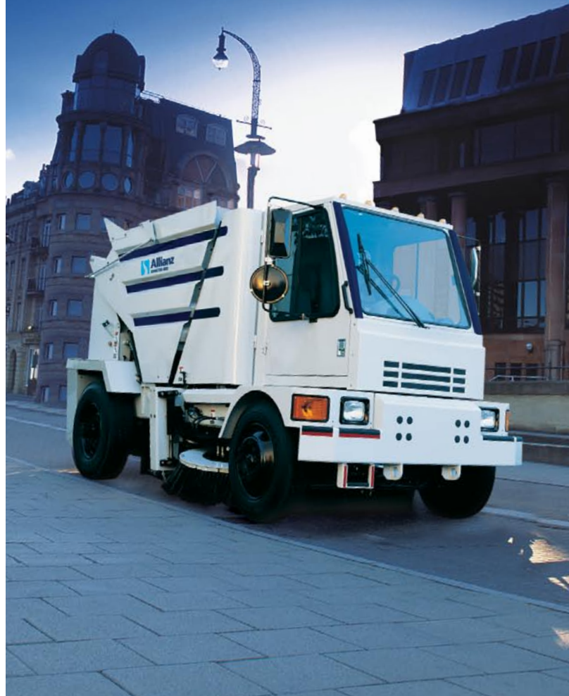
PICTURE Exceptional visibility increases operator and pedestrian safety