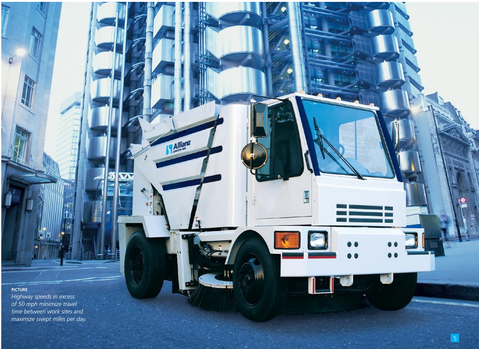
PICTURE Highway speeds in excess of 50 mph minimize travel time between work sites and maximize swept miles per day.

A centralized, weatherproof systems locker fully protects electrical and hydraulic components from the elements while it allows your maintenance people easy accessibility for inspection and troubleshooting.