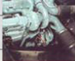
Carrier interchanger and state-of-the-art, air-to-air intercooling increase fuel economy and enable higher horsepower at lower engine speeds, resulting in lower engine life.