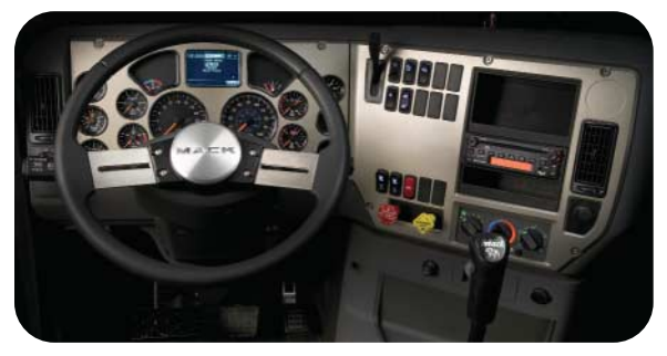
Brushed Nickel Dashboard Available in Pedigree and Champion Trims