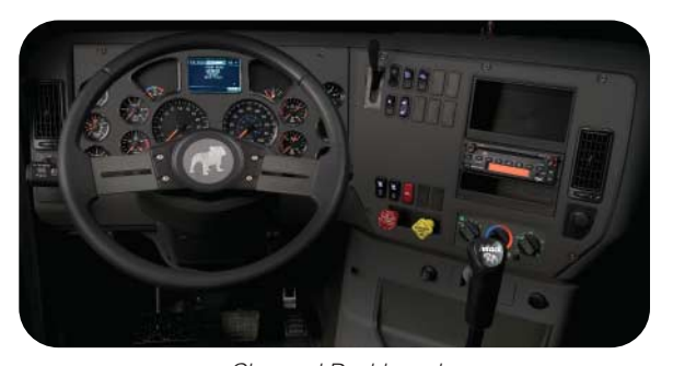
Charcoal Dashboard Available in Purebred Trim