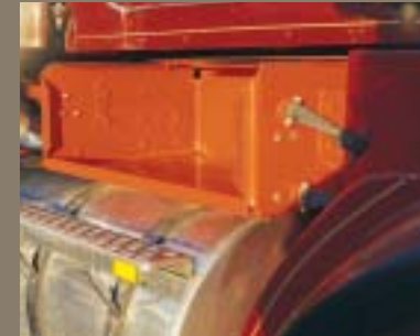
Under-cab tool box.