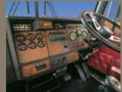
Stylish dash layout.