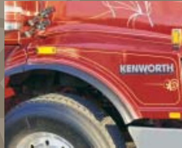
Set back front axle.

If you prefer to have tool boxes under the cab, the batteries can also be frame mounted.