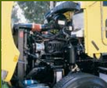
Service access is a breeze for the only bonneted truck in its class.