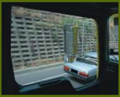
DAYLITE doors standard.