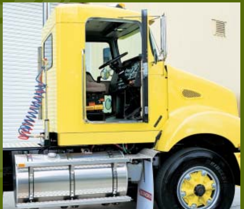
Safe and simple cab access for driver and passenger.