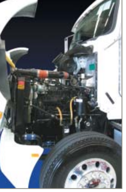
Service access is a breeze