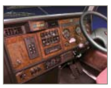
All the creature comforts and a full range of trim colours.