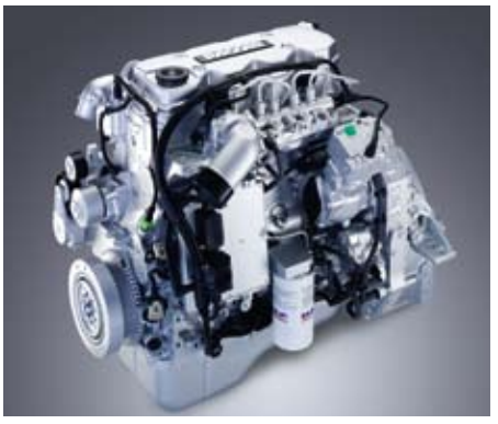
The 4.5 litre PACCAR FR diesel engine naturally complies with the ultra-low EEV emission requirements

circumstances such as these, the diesel engine remains at idle in order to drive various components, such as the steering pump and the air compressor. The LF Hybrid is also equipped with a start/stop system for zero fuel consumption and zero emissions when the vehicle is stopped.