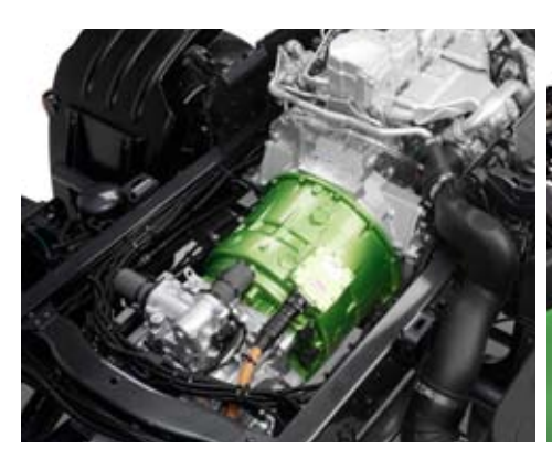
Between clutch and gearbox is the electric motor which provides drive as well as a generator function