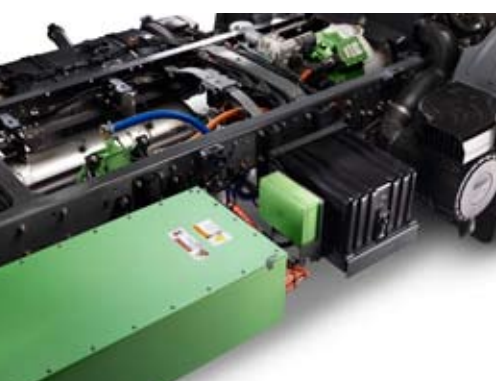
Energy released during braking is stored in special lithium-ion batteries